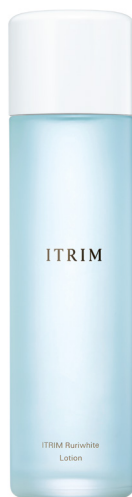
ITRIM Ruriwhite Lotion