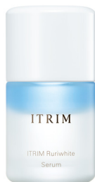
ITRIM Ruriwhite Serum

Medicated whitening beauty serum [quasi-drug]