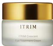
ITRIM Crescent Eye Treatment Cream 12g JPY 17,600 (including tax)