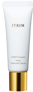
ITRIM Crescent Knee Treatment Serum 25g JPY 11,000 (including tax)

On the lower body, signs of aging show around the knees.