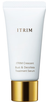
ITRIM Crescent Bust & Decollete Treatment Serum 30g JPY 13,200 (including tax)

The bust and décolleté areas determine the overall appearance of the body.