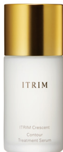
ITRIM Crescent Contour Treatment Serum 18mL JPY 17,600 (including tax)